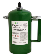
CRYSTAL CLEAN'S BRAKE CLEAN SPRAYER