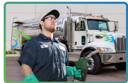
Collection of Used Antifreeze and Containers

Heritage-Crystal Clean's approach to waste management is focused on protecting the environment and creating a brighter, more sustainable future.