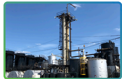
Transportation to Antifreeze Recovery Center