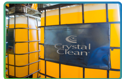
Closed Loop Reclamation & Distribution